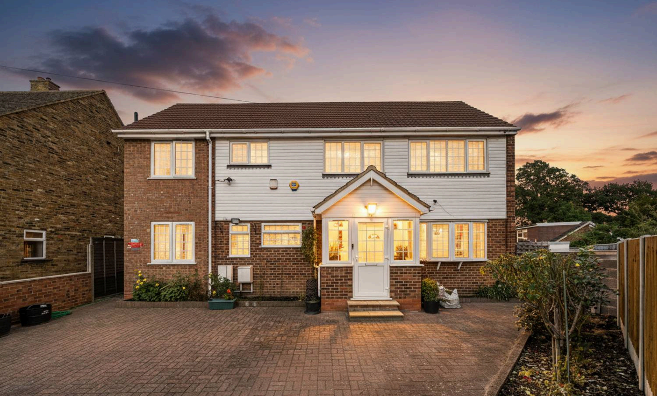
Newlyn Close, Uxbridge, UB8 3PA Guide Price £850,000 | Freehold